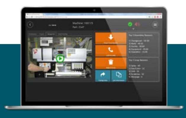
Example of an MES touch screen interface

MES also has built-in training certification or skills management capabilities. It offers the ability to control when an operator is ready and qualified to run a machine. Certification can be based on completed training or by an efficiency rating. For example, an operator may not be allowed to run a machine alone until they demonstrate a 60% OEE (Overall Equipment Effectiveness) or better. The information gathered by the MES is used with program controls to help you determine what employees to schedule on specific resources.