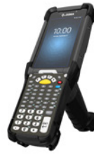
MC9300 Mobile Computer