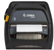
ZQ520 Mobile Printer