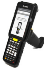
MC3300 Mobile Computer