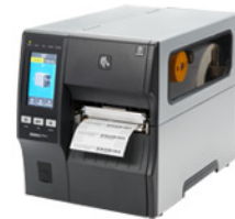
ZT411 Industrial Printer