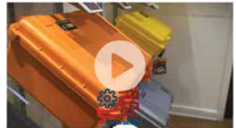
> Pelican Products