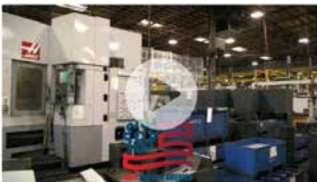
> Haas Automation