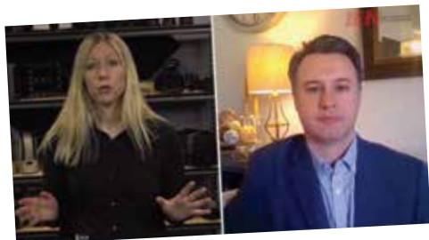
Infor > View