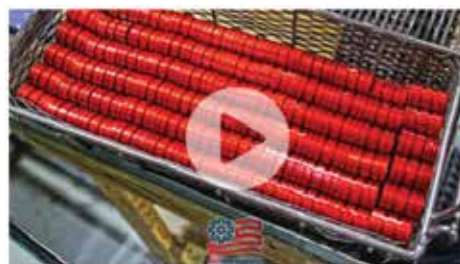
> PBC Linear