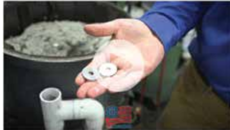
> Boker's, Inc.