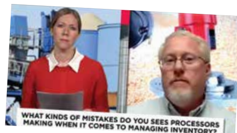
Bin Master > View