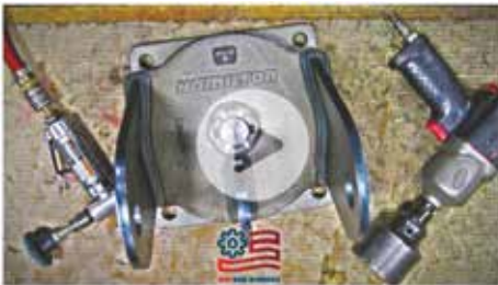
> Hamilton Caster