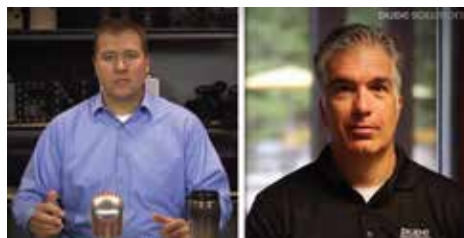
Dude Solutions > View