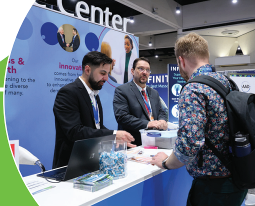
Exhibit Hall, Booth 3309

where there's always something happening!