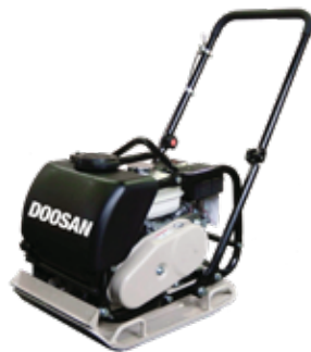
BX-60WH | BX-80WH | BX-120WH | VP-8RH