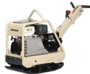
BXR-60H | BXR-100H | BXR-200H | BXR-300H