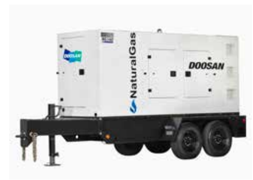
NG160 | NG225 | NG295

Designed to operate on municipal-supplied natural gas, liquid propane, and a broad range of oilfield wellhead fuel, these models are reliable, efficient and can greatly reduce operating costs compared with diesel units.