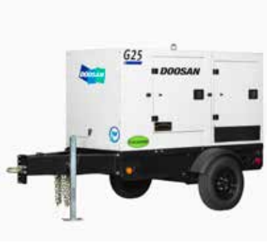
G25 | G40 | G50

Doosan Portable Power features a comprehensive mobile generator line up, ready to supply the power you need at the touch of a button. With customer friendly control panels, no generator has ever been easier to use.