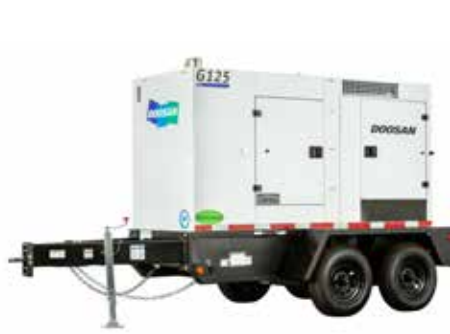
G70 | G125 | G150

Challenging applications demand powerful alternators. Doosan specifies high-output, separately excited alternators that ensure unmatched motor starting capability and precision voltage control.