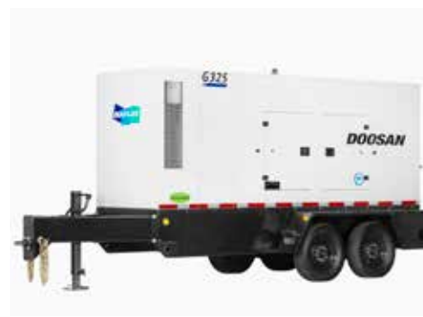
G190 | G240 | G325 | G400

Doosan mobile generators have been designed with the service technician in mind. With 500 hour intervals between fluid and filter exchanges, you can be sure that downtime for maintenance is minimized. All maintenance points are easily accessible and designed for fast and easy service.