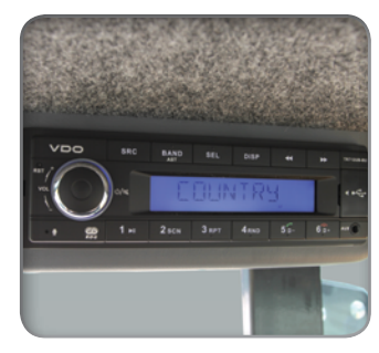
BLUETOOTH A hands-free bluetooth mp3 capable radio with weatherproof speakers is optional.