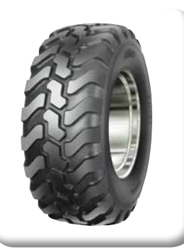
On / Off Road / Industrial Tires