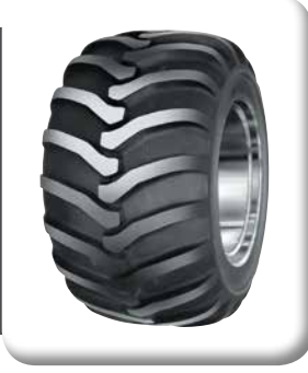
Ag / Industrial Tires