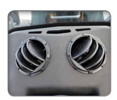
CLIMATE CONTROL Heat is standard on all cab models. Upgrade to air conditioning for total comfort.