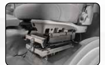
Suspension Seat with Adjustable Height Control