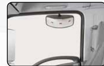
Passenger Side Ground Clearance Mirror