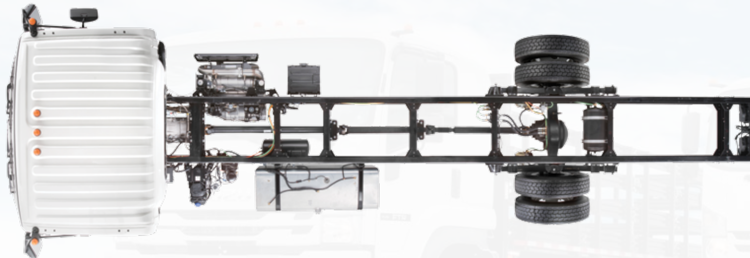
• Clean Frame • Body Lengths 14 to 30ft •