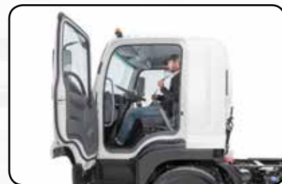
Doors Open 90° for Ease of Entry