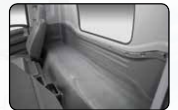
Large Storage Area Behind Seats