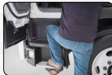
Wide Entry Step for Ease of Entry and Exit