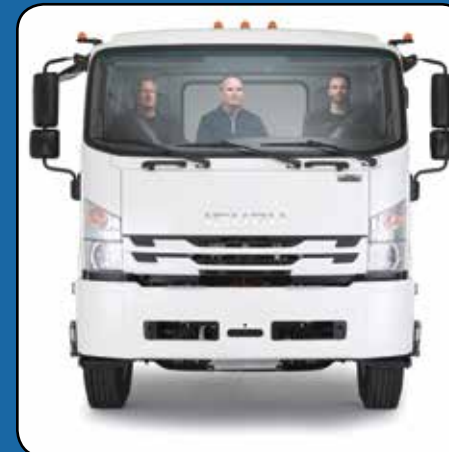
Three-Across Cab Seating

The FTR cab's wide step and wide-opening doors allow easy entry to the spacious interior of Isuzu's exclusive Hexapod cab, which features three-across seating and extra space for storage behind the seats. Other interior amenities include a side under safety mirror, overhead console and a suspension driver's seat with armrest specially designed to increase comfort and reduce driver fatigue.