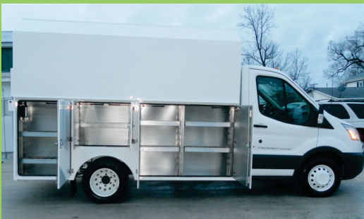
82" CA - 138" WHEELBASE

JOMAC'S NEW FORD TRANSIT SERVICE BODIES ARE CURRENTLY THE LONGEST, WIDEST, DEEPEST, AND LIGHTEST BODIES OF THEIR KIND.