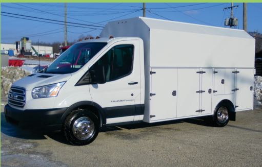
100" CA - 156" WHEELBASE

All aluminum construction for substantial weight savings and increased payload capacity.