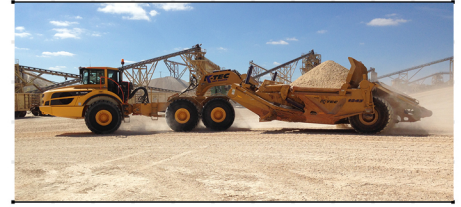
Topsoil / California, USA