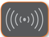
Reverse Sensing System

*Not available on the G5-18. Available on the G5-18A only.