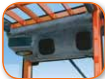
Radio Ready Kit†