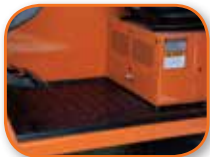
Molded Floor Mat†