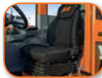
Air Ride Seat†