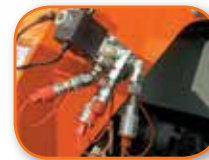
2nd Auxiliary Hydraulics†