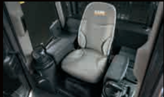
Enhanced operator environment includes upgraded dashboard and suspension seat.

*15-foot-6-inch cab-to-ground range on the 2050M with PAT blade