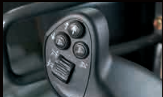
Convenient controls put blade and steering adjustments at your fingertips.

CASE dozers put convenient blade controls right at your fingertips. Operators can adjust sensitivity of the blade movement to match operator preference and job site requirements on the 1650M and 2050M. Adjustments to blade sensitivity are made through the Advanced Instrument Cluster (AIC). There are also dedicated buttons for automatic Blade Shake to help with shedding material off the blade, and a Fine Grading command, which instantly cuts blade speed by 40% for increased accuracy.