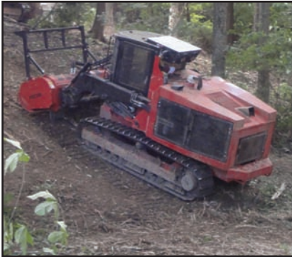
45° Gradeability with Power to Cut and Climb