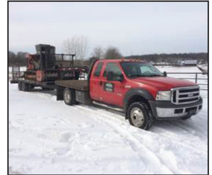
Compact Size allows Easy Transport