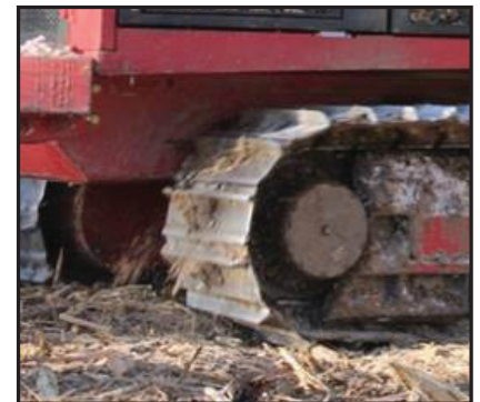
Strong Track Power for Difficult Terrain 20" Shoes for 3.8psi