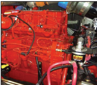
Fuel Efficiency with Power to Perform