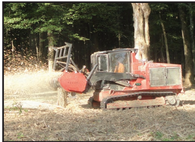
128HP AND 60GPM COUPLED WITH FECON POWER MANAGEMENT DELIVERS HIGH PERFORMANCE IN MULCHING, STUMP GRINDING AND MORE!