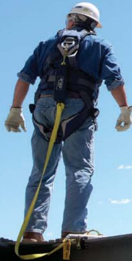
TRADITIONAL FOOT LEVEL TIE-OFF LANYARD

The Nano-Lok™ edge retracts unused lifeline, virtually eliminating this potential.