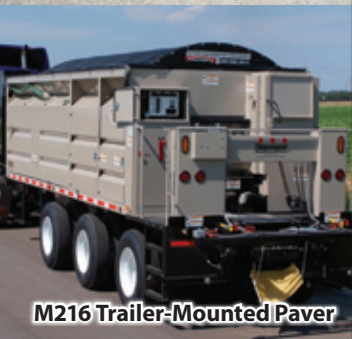
M216 Trailer-Mounted Paver