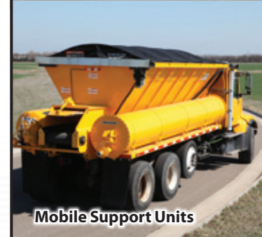
Mobile Support Units