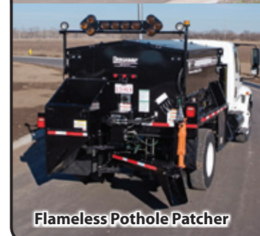
Flameless Pothole Patcher