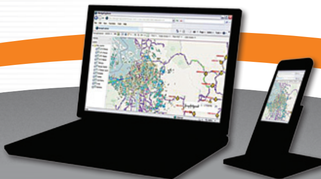
2. EVALUATE RESULTS