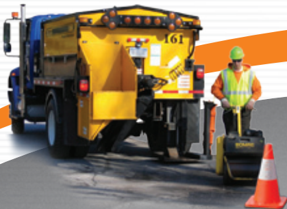
1. PATCH & COLLECT DATA