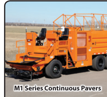
M1 Series Continuous Pavers