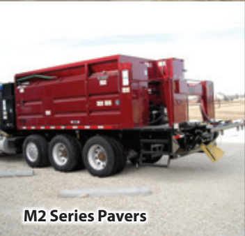
M2 Series Pavers