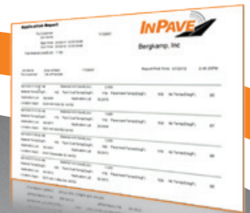
3. INSTANT REPORTING