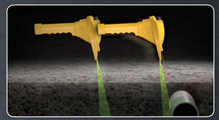
Holding the AML's handle parallel to the ground, scan the area of the suspected pipe or buried object until one or both of the AML's target indicators activate.

you locate buried PVC pipes. The AML is a highly-sensitive patented tool that utilizes advanced, ultra-high microwave frequencies to find plastic PVC pipes and nearly any other subsurface object that has an edge. Utilizing technology that was originally developed for lunar exploration, the AML will locate subsurface materials indiscriminately - plastic, metal, wood, cable or pipe. Unlike the deficiencies of GPR (or Ground Penetrating Radar), the AML will function in clay, wet soil, snow or standing water without the need for a separate transmitter and receiver, wires, clips or clamps. Designed specifically to locate PVC piping for the utility, water, gas and cable industries, the AML's lightweight, patented technology allows it to locate objects