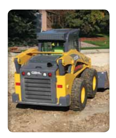
provides excellent weight distribution, enhancing machine stability. A rear bumper and counterweight on the model V330 add protection and towing capability.