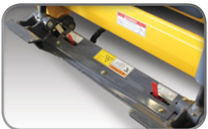
Power-A-Tach® system option allows users to quickly install and remove attachments. An operator leaves the