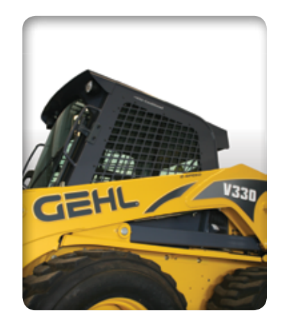
the sides, rear and front is achieved with a unique, low-profile boom design. A roof window allows the operator to view the lift arm when in the fully raised position.