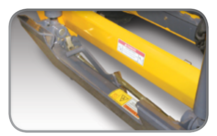
ALL-TACH® SYSTEM All models feature the easy-to-use All-Tach® (universal-style) attachment mounting system compatible with

Time is priceless no matter where your machine goes, so Gehl has made it simple and fast to hook-up a wide variety of available attachments.