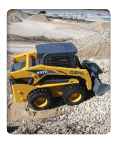
extra Long wheelbase of up to 55 inches (1387 mm) enhances machine stability when lifting and loading and provides a smoother ride over rough terrain.