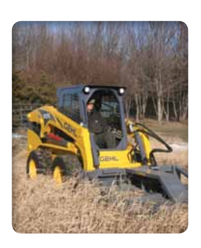
AUXILIARY HYDRAULICS are standard, powering many attachments. Optional high flow increases their capability. Dependent on control pattern, a rocker switch or foot pedal provides electronic proportional flow control.