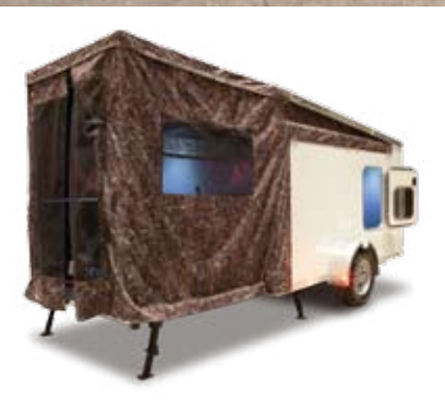
A tent or canvas screen room can be added to the Mod Pod to make it ideal for camping trips.