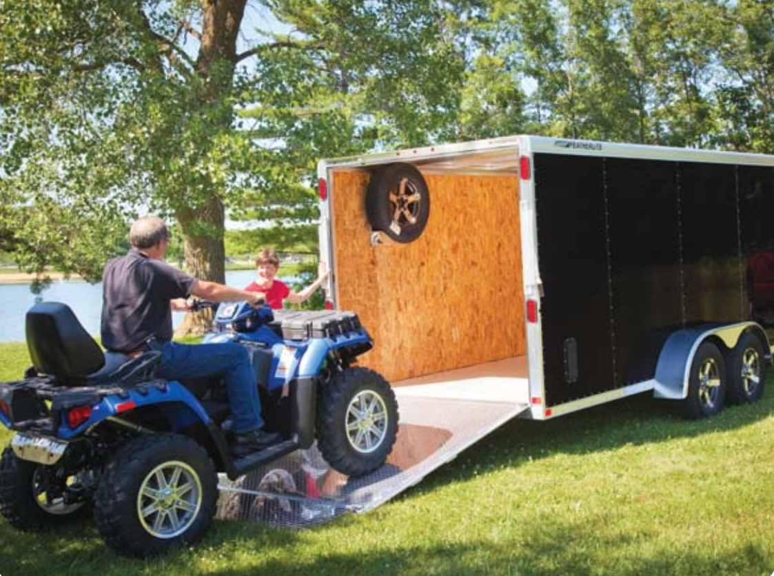
GET A QUOTE! fthr.com/quote