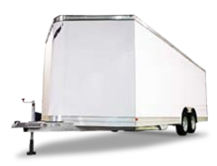
Trailers may be shown with options.