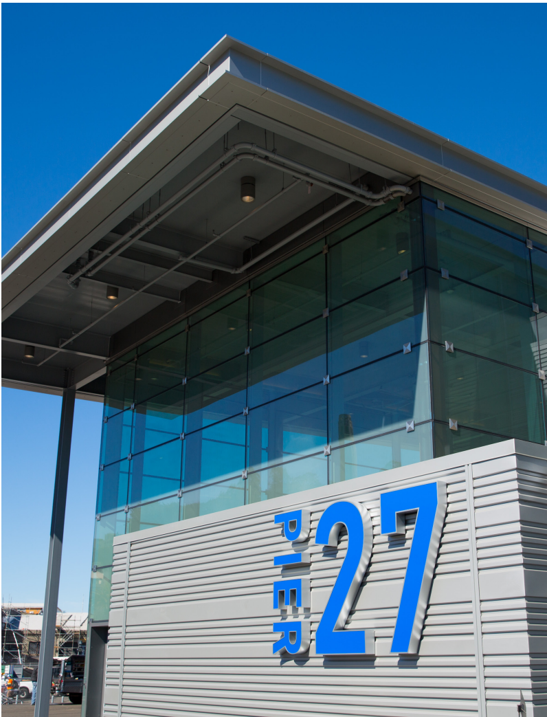
Pier 27 San Francisco, California