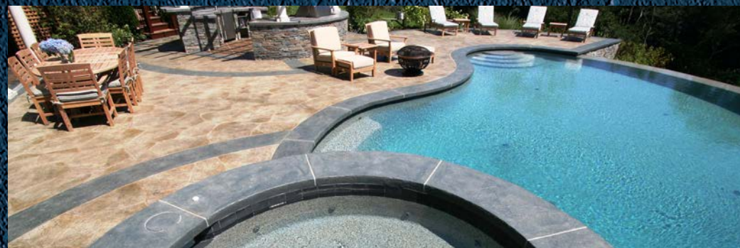
New England Hardscapes, Acton, MA

Questions: Contact Bev Garnant @ 314-962-0210