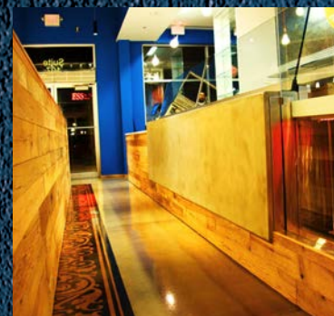
Hyde Concrete, Annapolis, MD