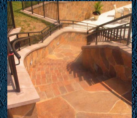
Sundek of Washington, Chantilly, VA