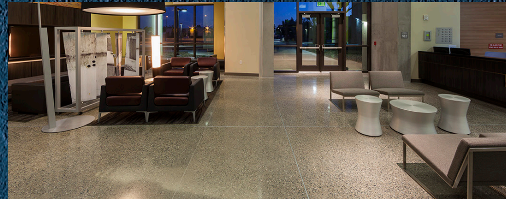
T.B. Penick & Sons, Inc., San Diego, CA