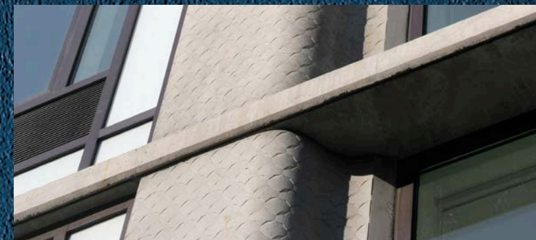
Gerner Kronick + Valcarcel, PC, New York, NY