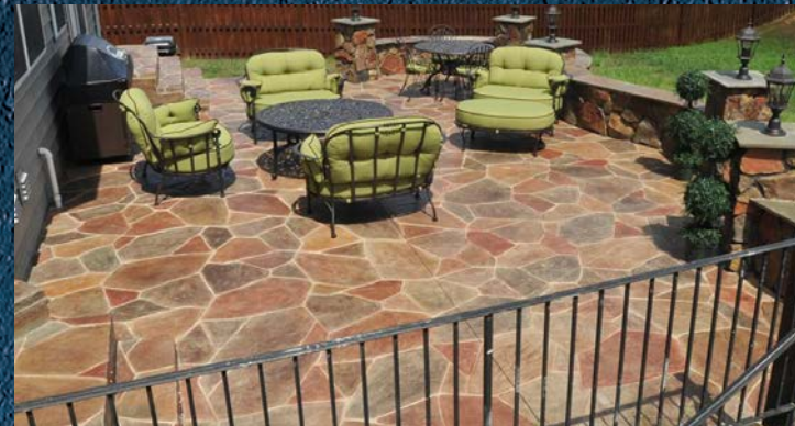
Salzano Custom Concrete, Centreville, VA