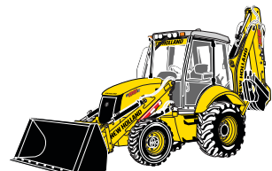
B95C/B95C TC/B95C LR/B110C , 2012-