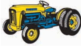
2000 LCG , 1960-1964