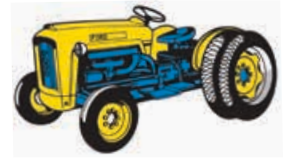
4000 LCG , 1960-1964