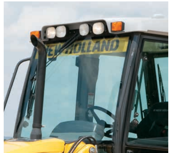
4 front working lights and 4 rear working lights (on all models equipped with variable flow pump)