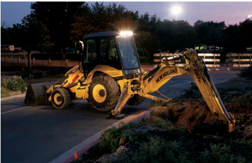
Excellent lighting for night working