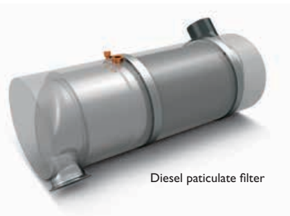
Diesel particulate filter