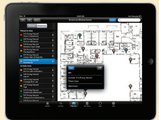
Capture critical project data in the field including safety notices, RFIs, Punch Lists and more.