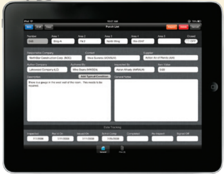
Prolog Mobile works seamlessly with Prolog Manager or Prolog Converge.